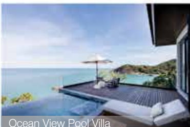
Ocean View Pool Villa

Breathe in the freedom of wide open space as you gaze over the endless views of sparkling sea. Room facilities and services: (Your pool: 3.0 x 10.30 m.)