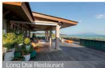
Long Dtai Restaurant