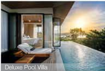
Deluxe Pool Villa

After a morning stroll to the beach or to the pool return to your home from home and relax (Your pool: 3.00 x 10.30 m.)