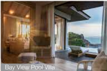
Bay View Pool Villa

Uplifting day-time views of the sea framed through delicate foliage and evenings of pure comfort. (Your pool: 3.00 x 10.30 m.)