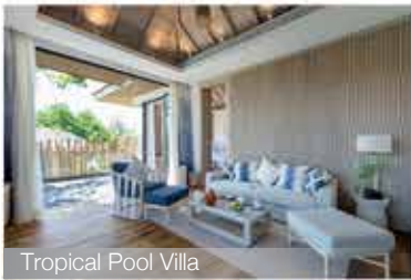
Tropical Pool Villa

Tropical Pool Villa (3 units) Room size 75 sq.m. (Total area 300 sq.m.)