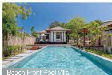
Beach Front Pool Villa