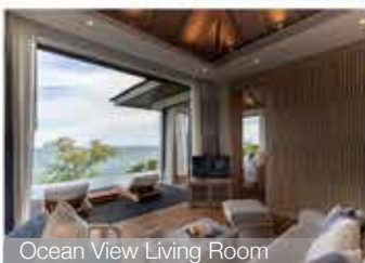
Ocean View Living Room

Perched high on the hill in true tropical surroundings enjoy the luxury of an extended pool beneath spectacular skies. (Your pool: 3.80 x 14.55 m.)