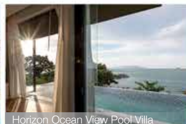
Horizon Ocean View Pool Villa