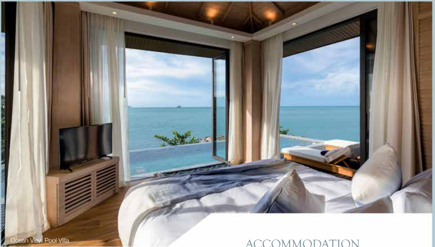
Ocean View Pool Villa