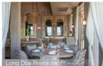
Long Dtai Restaurant