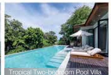
Tropical Two-bedroom Pool Villa