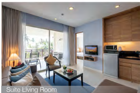
Suite Living Room