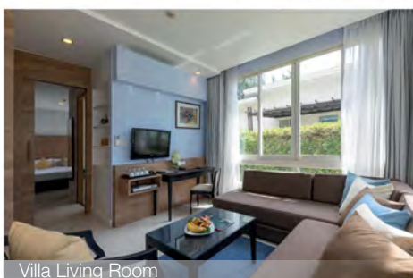
Villa Living Room