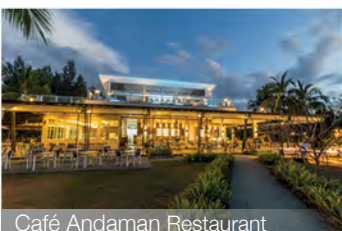
Café Andaman Restaurant

Room service is available until midnight and serves a wide range of Thai and International dishes.