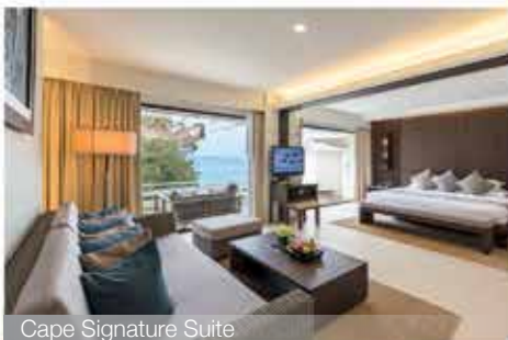
Cape Signature Suite