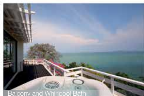
Balcony and Whirlpool Bath