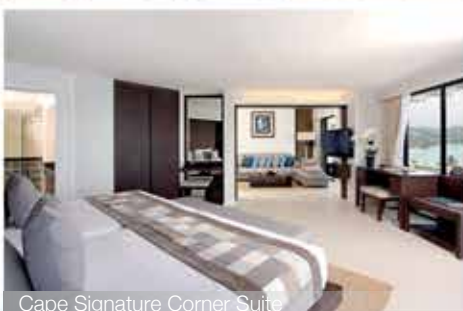
Cape Signature Corner Suite