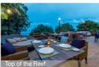
Top of the Reef

Room service is available 24 hours and serves a wide range of Thai and international dishes.