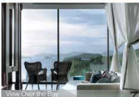
View Over the Bay