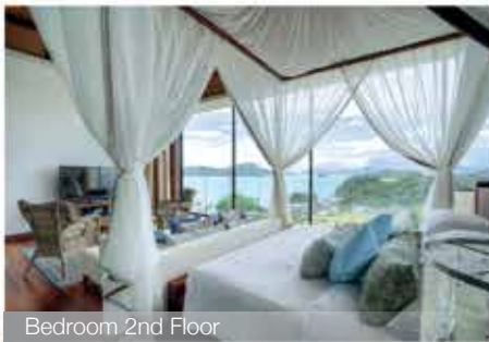
Bedroom 2nd Floor