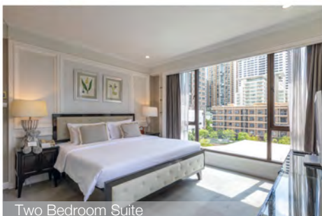
Two Bedroom Suite