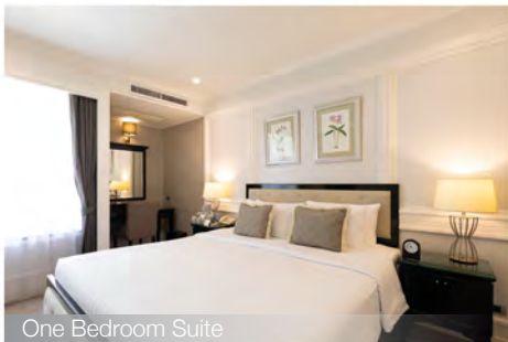
One Bedroom Suite