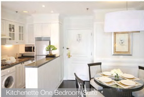
Kitchenette, One Bedroom Suite