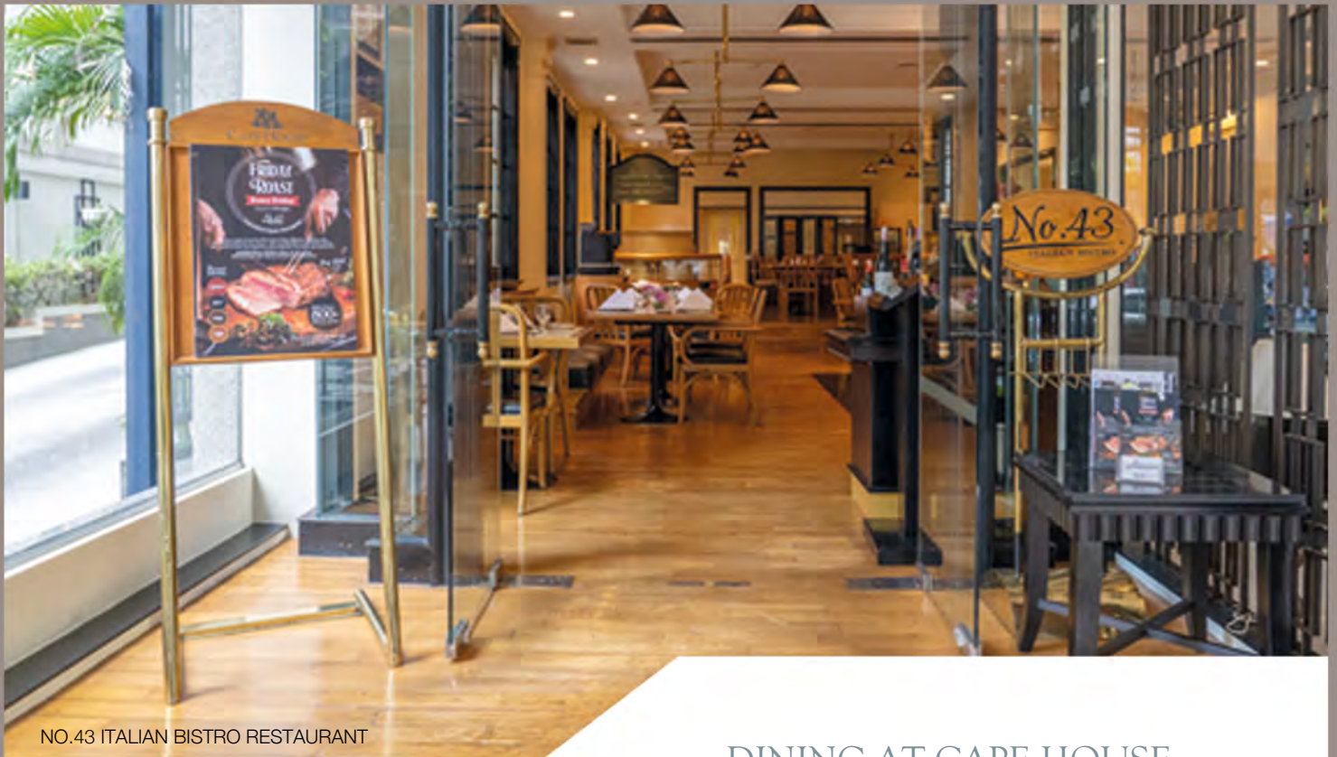
NO.43 ITALIAN BISTRO RESTAURANT