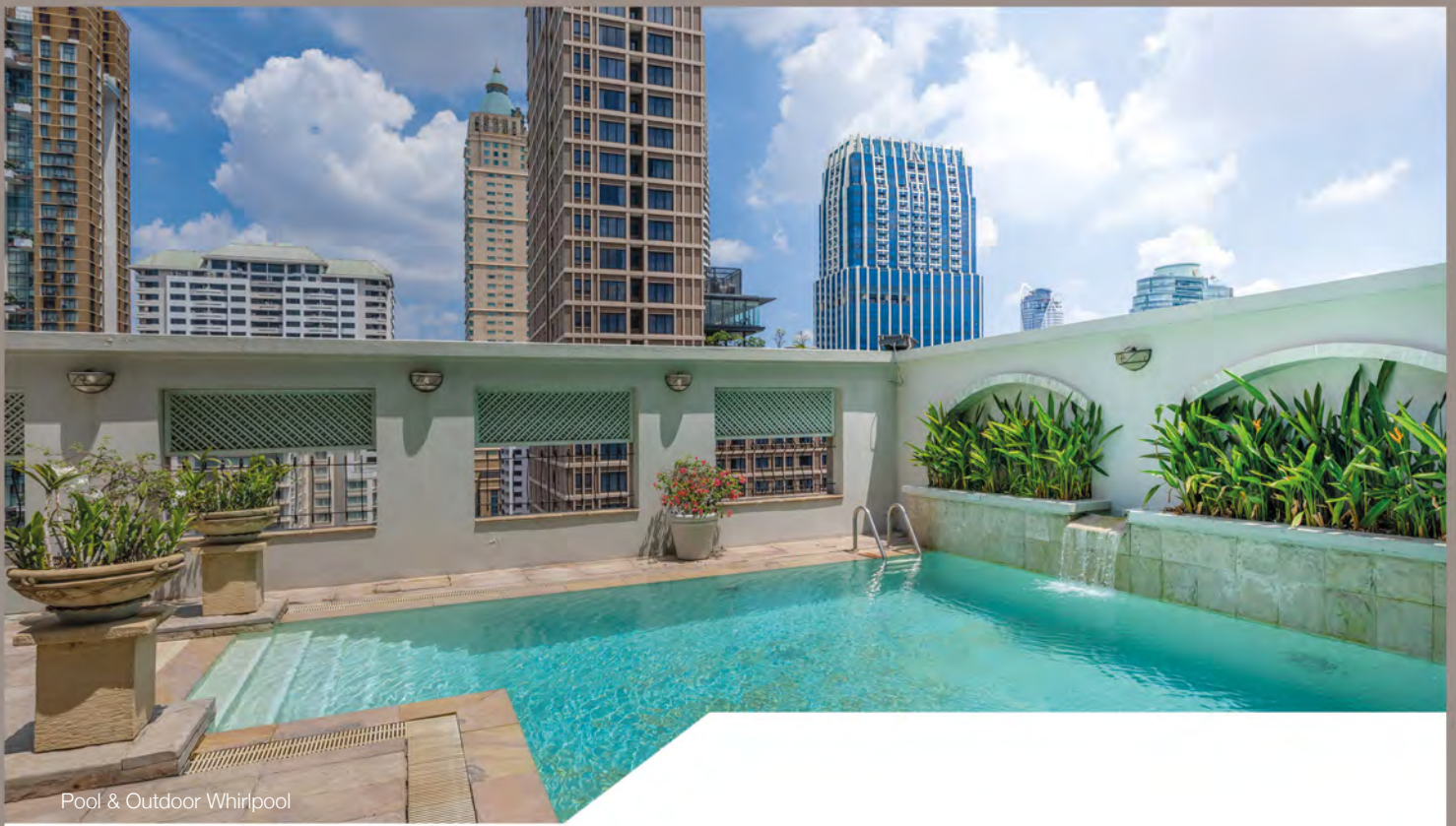
Pool & Outdoor Whirlpool