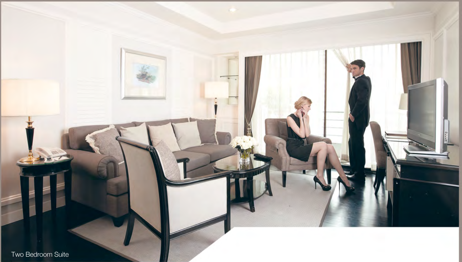
Two Bedroom Suite